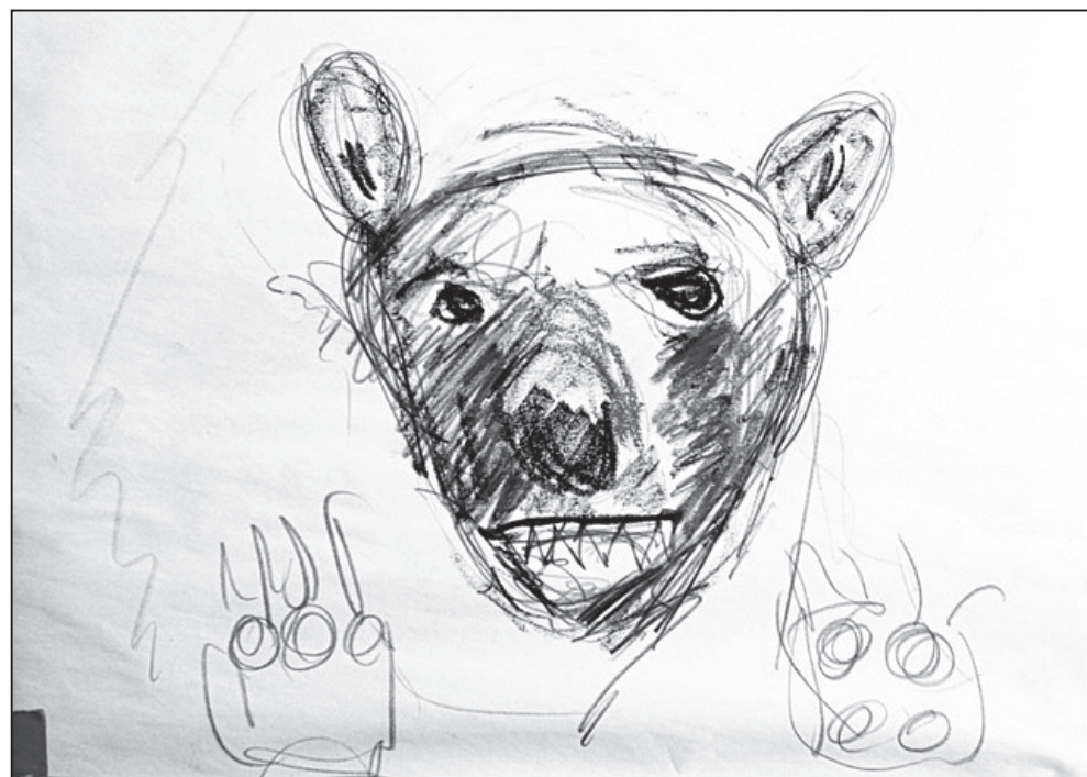
The title of John's is: You vs. The Bear (detail) ; mixed media, 2024

Greiner-Ferris will be showing a series of six 4’ x 3’ pieces he began in January 2024 and contin-