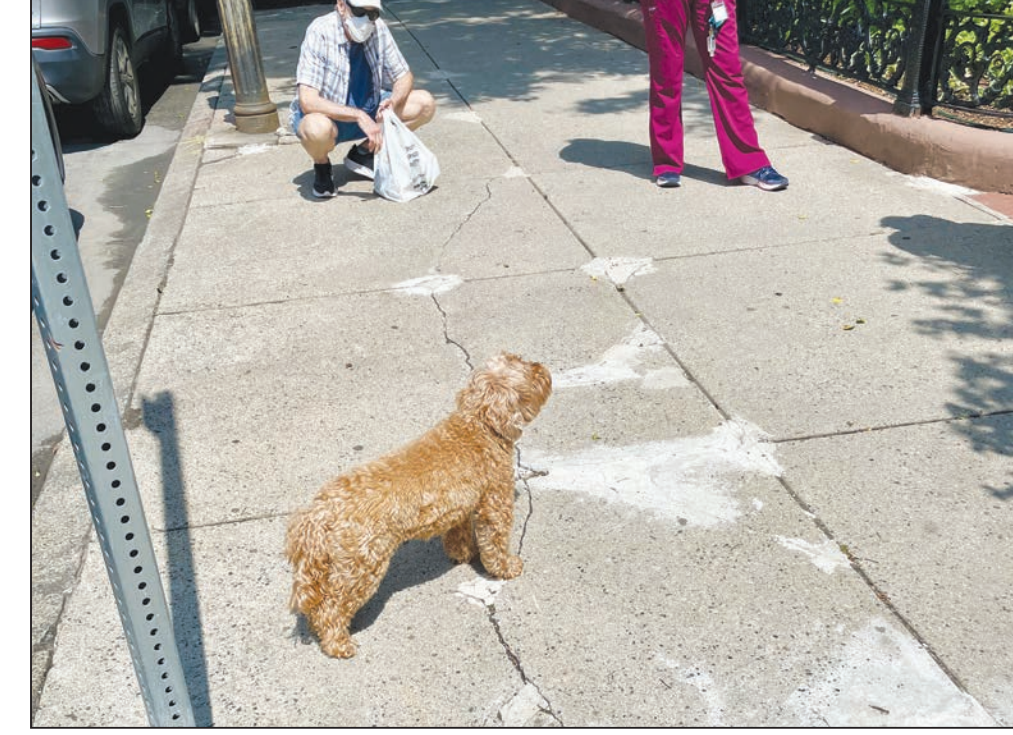
Three neighbors surrounded this dog who had pulled out of its collar while tied up with a pack of eight dogs outside a building.

Call animal control. They have the tools and training to capture stray