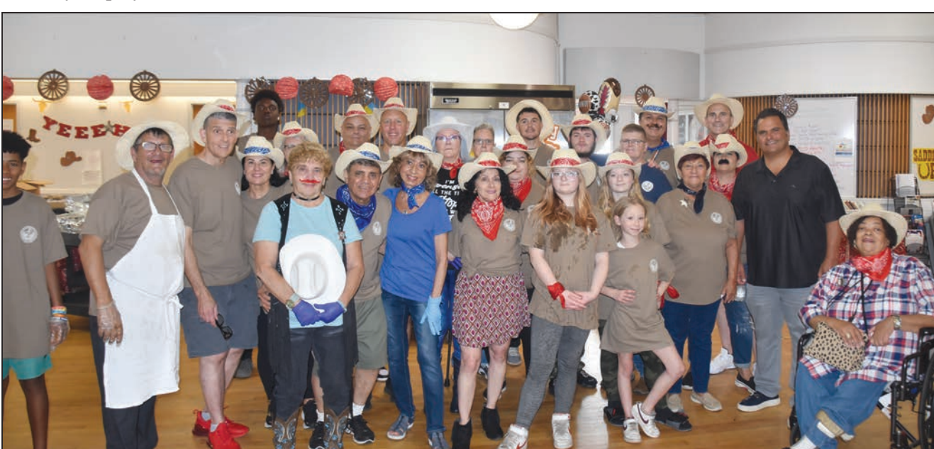
The team of volunteers for the Senior Summer Barbecue.