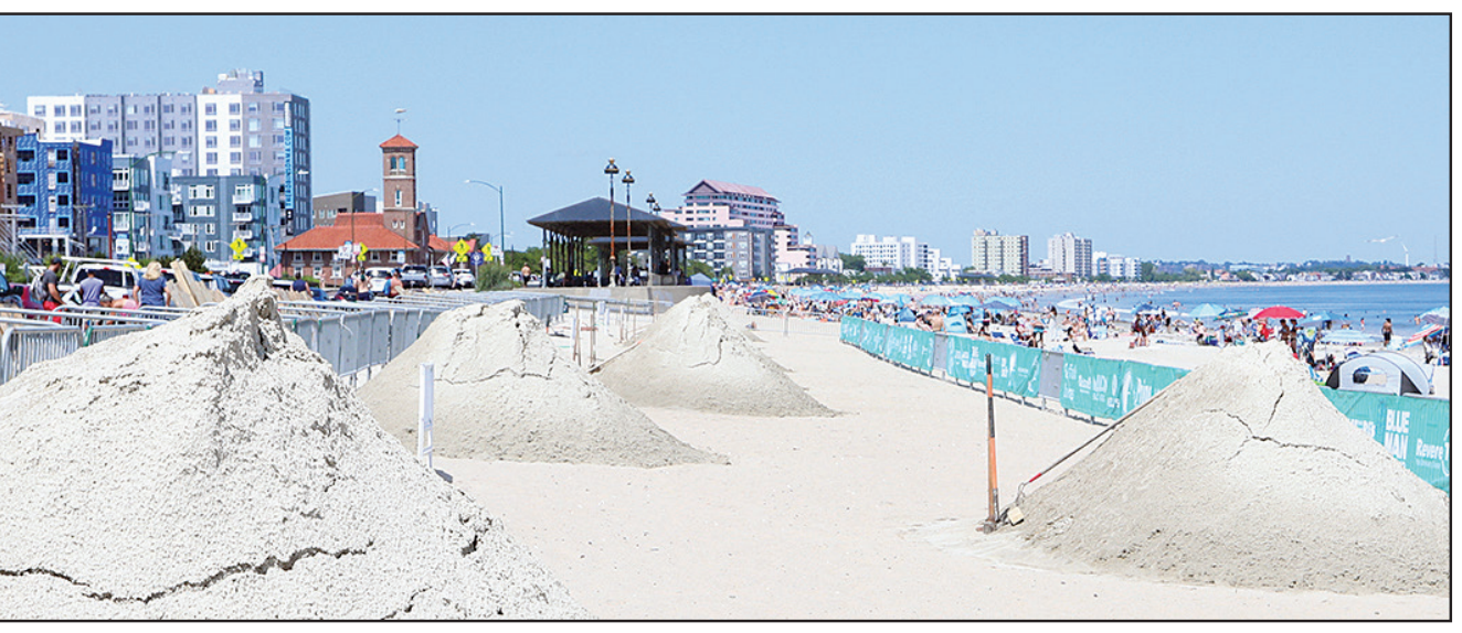
The special sand for sculpturing is in place along Revere Beach's shoreline, ready to be transposed into greatness, and in the image of this year's celebrity, King Kong.

able for purchase. The most up to date information can be obtained at www.rbissf.com, or on social media.