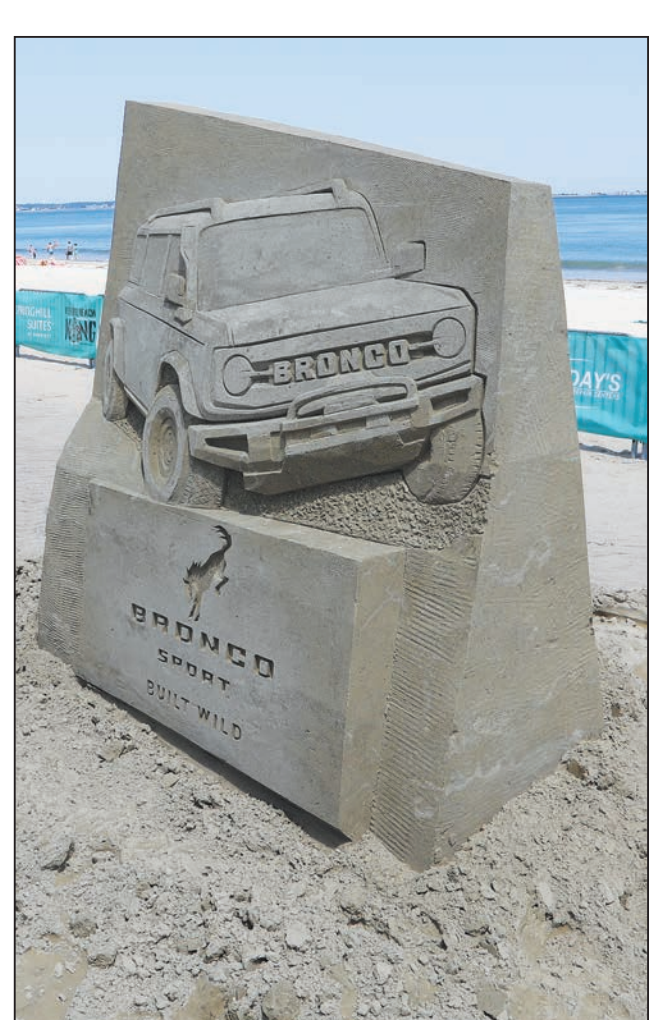
There are several sponsor exhibits partially or completed for your viewing pleasure, one even at the foot of the Boulevard Bridge.

Celebrating his 90th Birthday, King Kong will be visiting