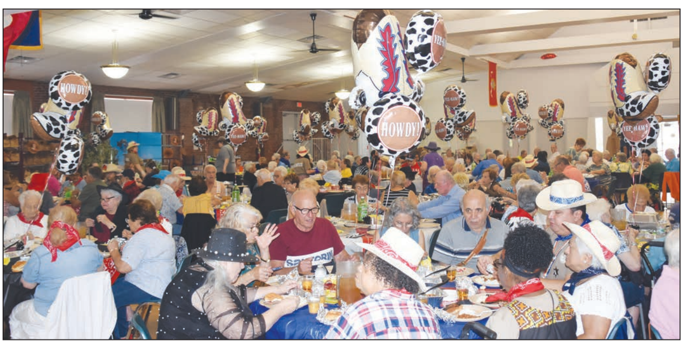
The Connolly Center was packed with attendees for the Senior Summer Barbecue.