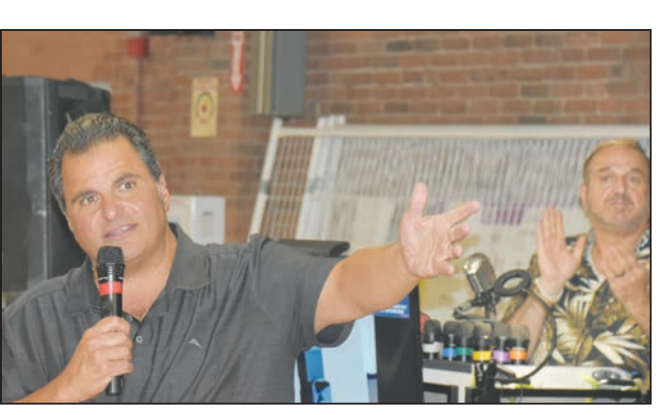
Mayor Carlo DeMaria speaking to attendees.