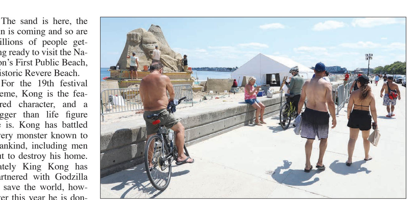
A beautiful sunny Sunday on Revere Beach brought bathers and walker to its location, all stopping to see the center piece come to life.

ly friendly. From Friday July 28 running through Sunday, July 30, the event will be officially opened, although the sculptures will remain long after the