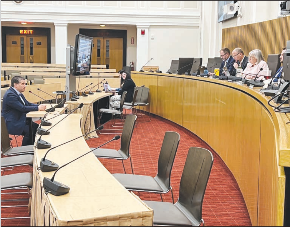
Senator DiDomenico testifies at the Education Committee Hearing.

The Food System Caucus is comprised of a bipartisan group of 158 legislators from every corner of the Commonwealth that works to ensure that our food producers and consumers have a seat at the table and advance legislation that will give them the support they need and deserve. This group will now be advocating in support of their handful of endorsed bills, including Universal School Meals.