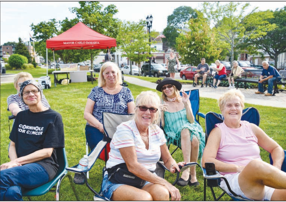
Attendees brought their own chairs to watch and listen to the performance.