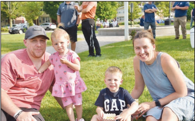
Families attended the concert at Wehner Park.