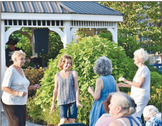
Those who attended couldn’t resist dancing to the music.