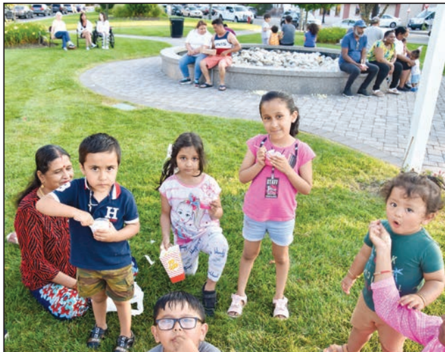
Attendees enjoyed free popcorn and ice cream with the show.