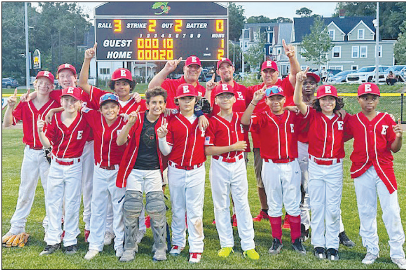
The Everett Little League All-Star team, players and coaches, are pictured after winning the District 12 championship in Dorchester.