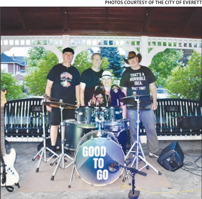
The Good to Go band.