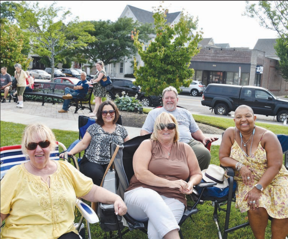
Attendees enjoying the concert at Wehner Park.