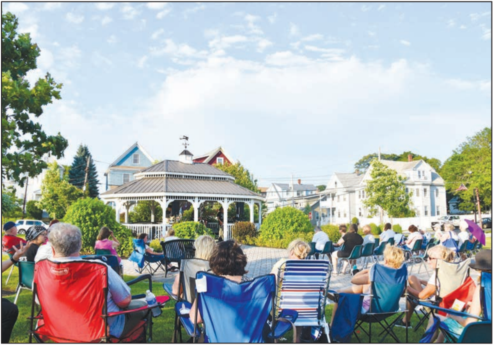
It was a perfect evening for a concert at Wehner Park.