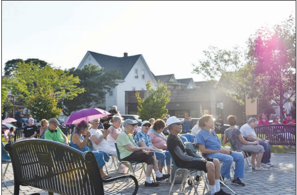
Attendees enjoying the performance in front of the gazebo.