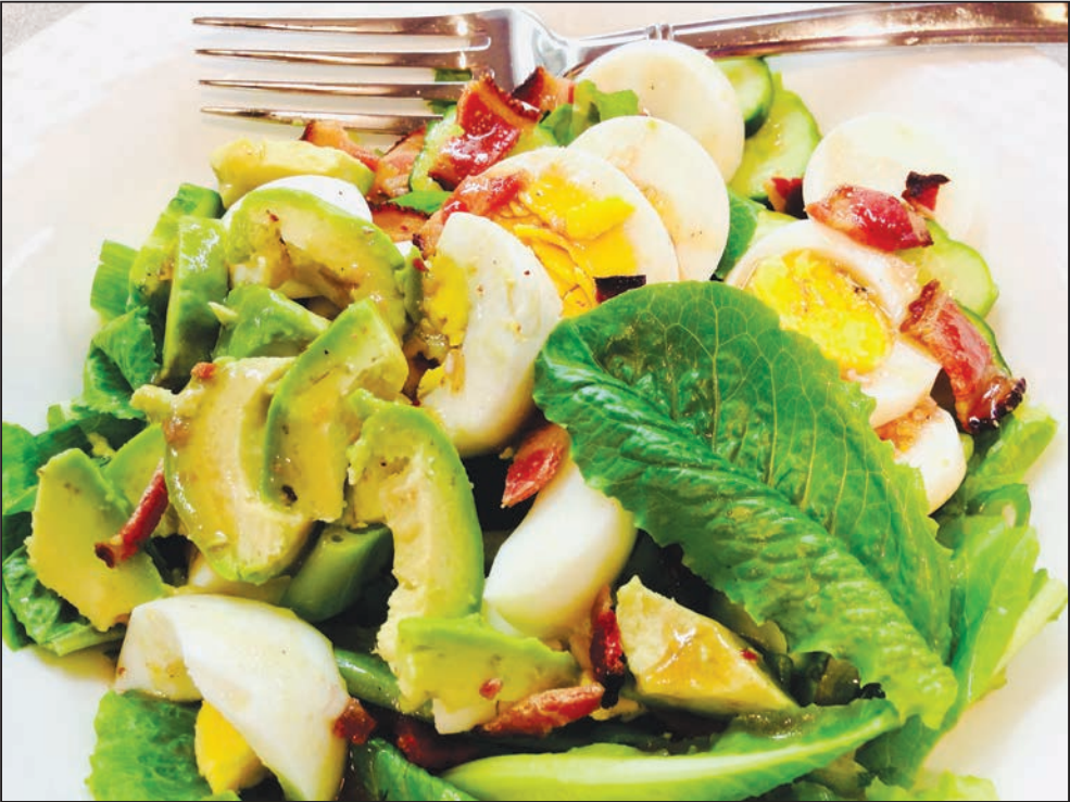
Once upon a time, this would have been called a "Chef's Salad." We call it a "Supper Salad" and make one often to use up the bits and pieces in our refrigerator.

From Thailand, we enjoy a larb salad. This is a spicy hand-chopped meat salad seasoned with fish sauce, chili flakes, and lime juice. Traditionally it is made with pork and served with sticky rice, but we love a chicken version served with lettuce