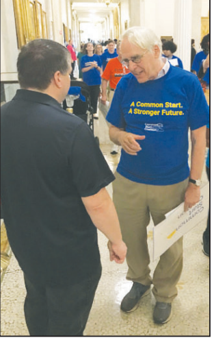
Senator DiDomenico speaks with an early education and care advocate.

education and childcare and deliver significantly better pay and benefits for early educators. We must pass this bill and keep our state a livable and welcoming home for families of all incomes." The Common Start bills in the Senate and the House, respectively, are S.301 and H.489, an act providing affordable and accessible high-quality early education and care to promote child development and well-being and support the economy.