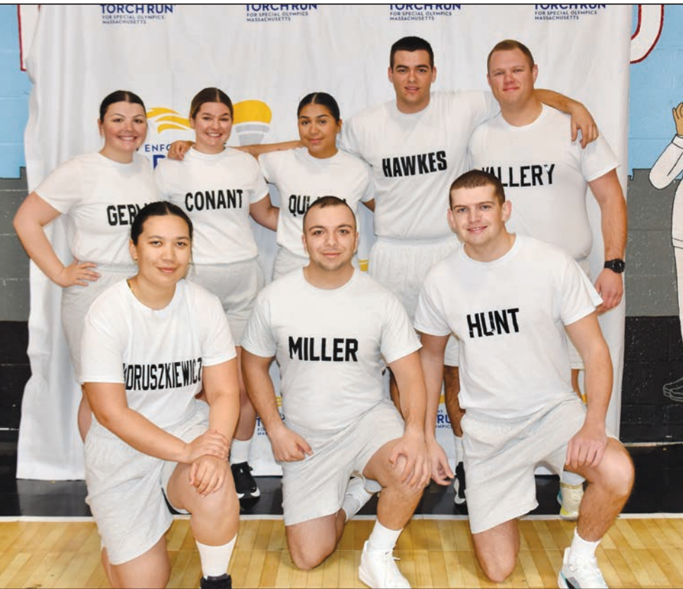
Recruits from the Lynnfield Police Academy participated in the event.