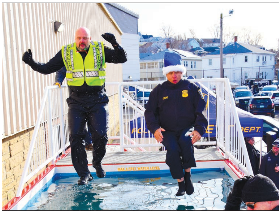
Everett Police Lieutenant Larry Jedrey and Chief Paul Strong jumping into the frigid water. See Page 6 for more photos.

The Polar Plunge is a fund-raising initiative put forth by the Special Olympics Massachusetts where participants brave the cold and take the plunge into a frigid pool to support more than 14,000 athletes of all abilities in sports training and competitions that the organization offers year-round.