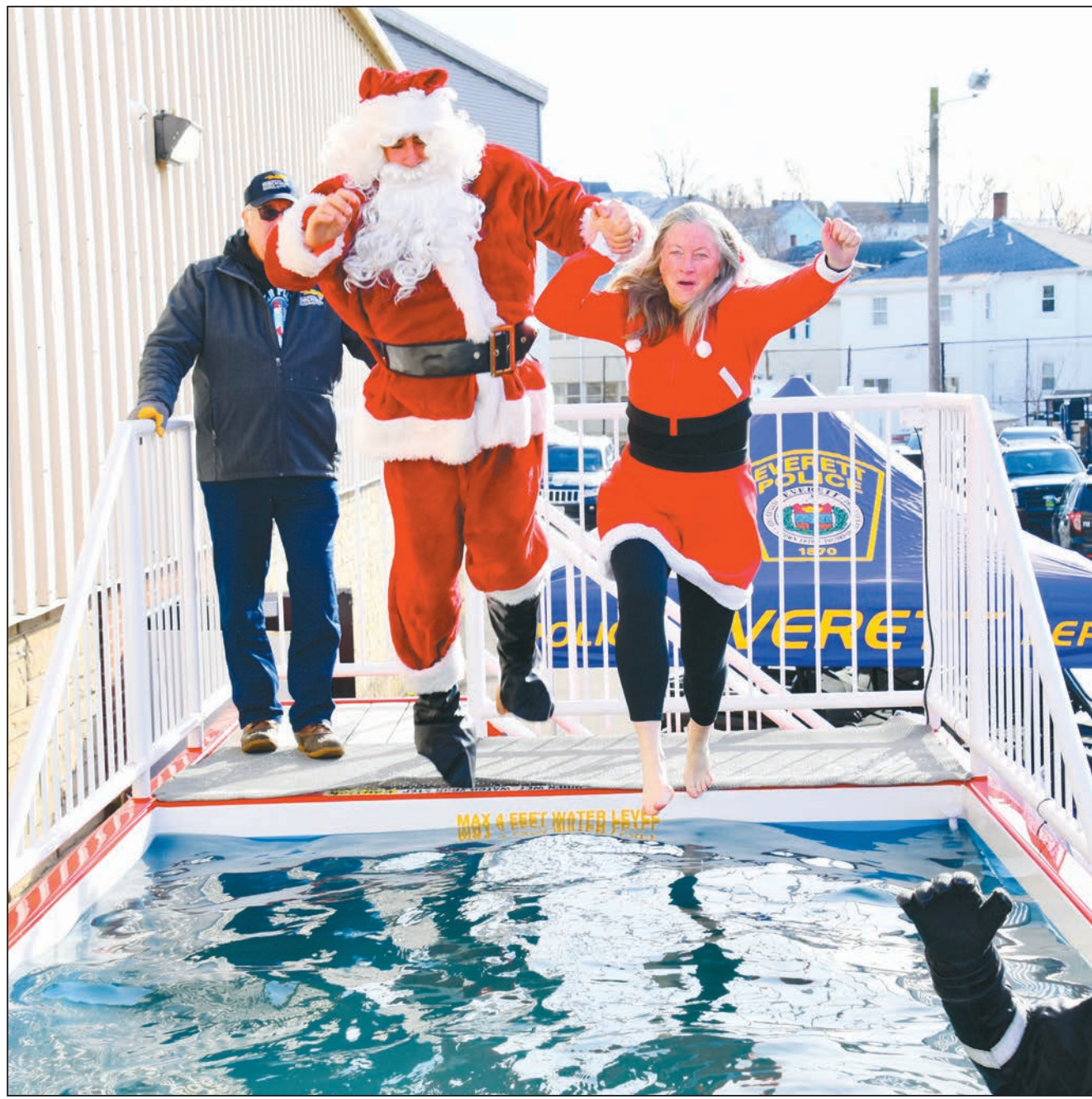
Participants dressed up in costumes and took the polar plunge outside of the Everett Recreation Center.