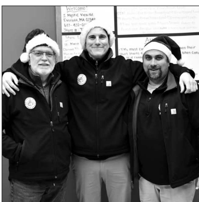
City staff from the Inspectional Services and Wire Departments helped volunteer at the event.