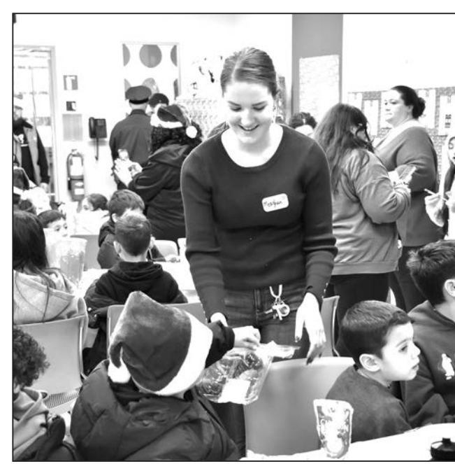
A Target staff member serving the last cookie to a youth participant.