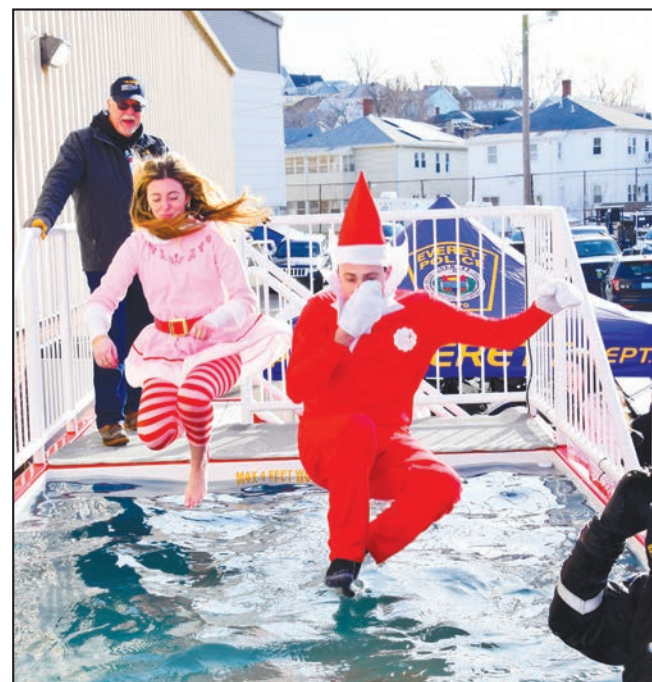
Participants taking the polar plunge.