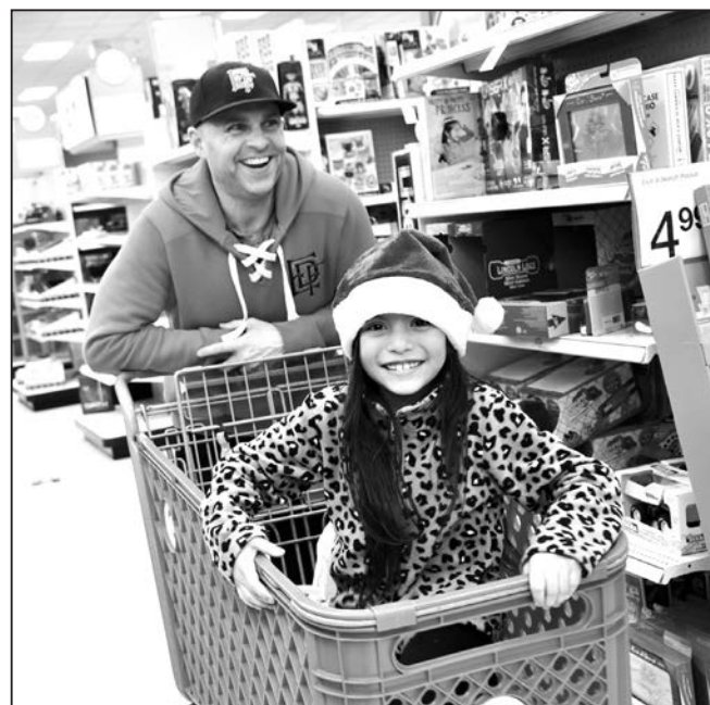
A volunteer from the Everett Fire Department and youth shopper having fun shopping.