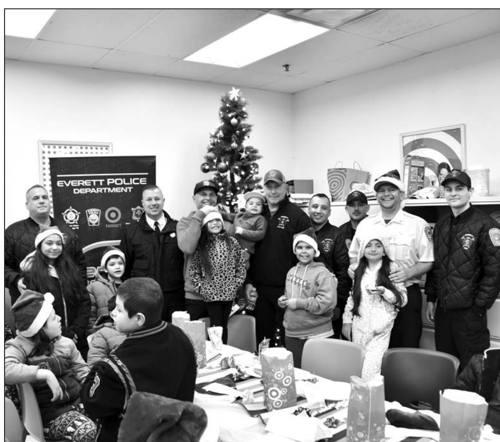
Members of the Everett Fire Department.