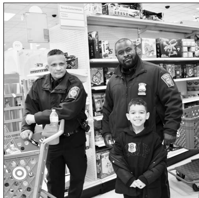
Everett police officers joined alongside one of the youth shoppers.