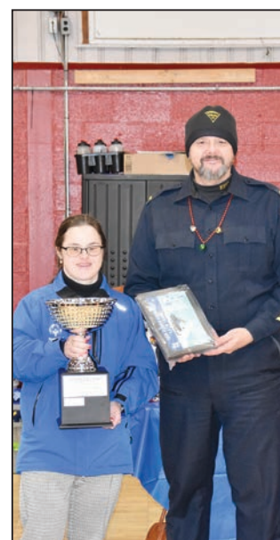
The Everett Police Department won the award for highest amount donated by an organization.