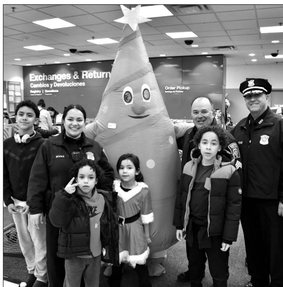
Everett police officers and kids joined together for a fun evening of shopping at Target.