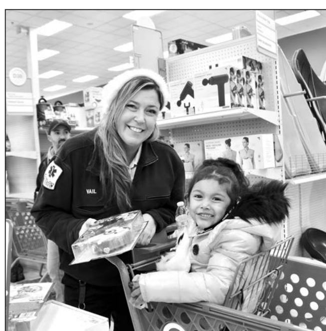
A member of the Cataldo Ambulance Service shopping with her youth partner.