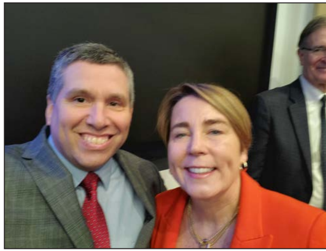
Senator Sal DiDomenico with Governor Maura Healey

state with the Governor in Cambridge," Senator Sal DiDomenico. "Among the many things this law does, I am most excited about the $10 million in local funding I secured for my district, language I included that will allow for the construction of a transformational soccer stadium and waterfront park in Everett, significant investments in life sciences, and a new provision empowering public agencies and municipalities to enter into project labor agreements. I want to thank Governor