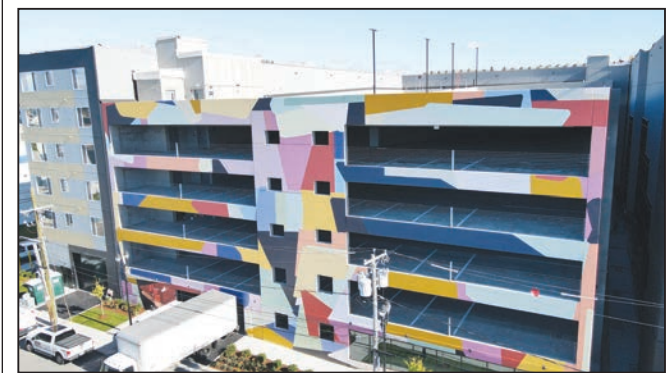
Accompanied by attractive, sophisticated amenities and complemented by public art from muralist Jenna Pirello, Maxwell’s 384 new housing units are part of Greystar’s 1,900 unit, $880 million investment in the City