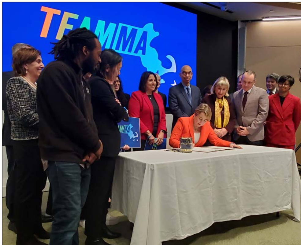
Governor Healey signing the Economic Development bill.

the conference committee for helping pass this important piece of legislation for my residents and our entire state."