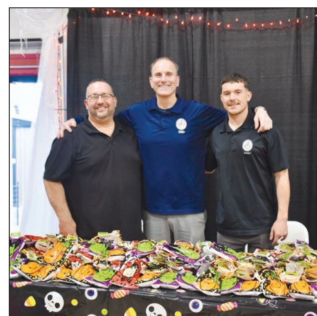
City staff volunteers handed out gift bags filled with candy and fun items at Mayor DeMaria's table.