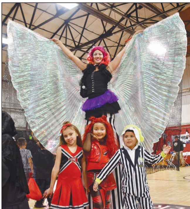
Attendees alongside one of the many characters and performers that could be found throughout the event.