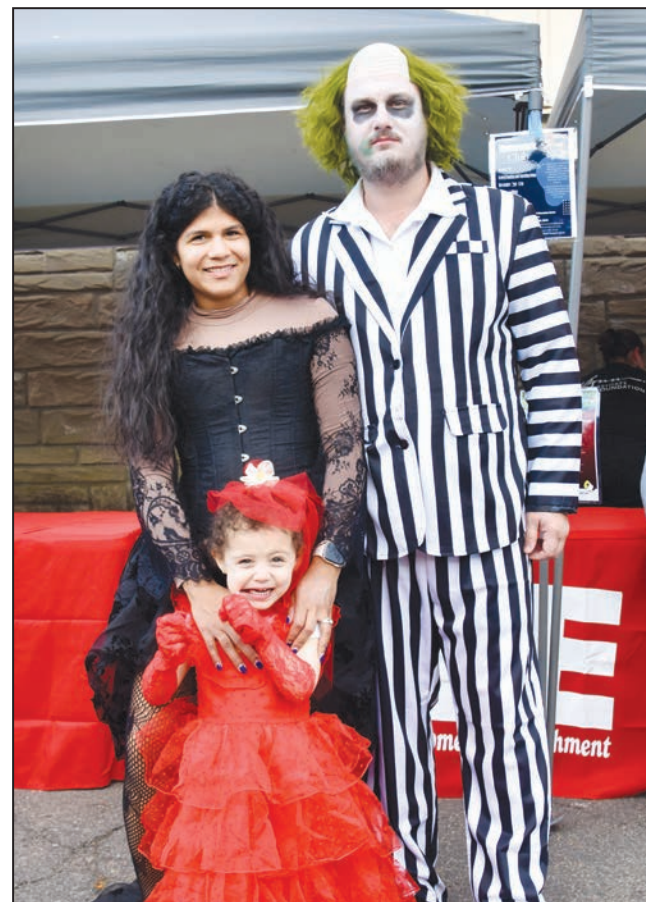
Attendees dressed up in costume and enjoyed the festivities.