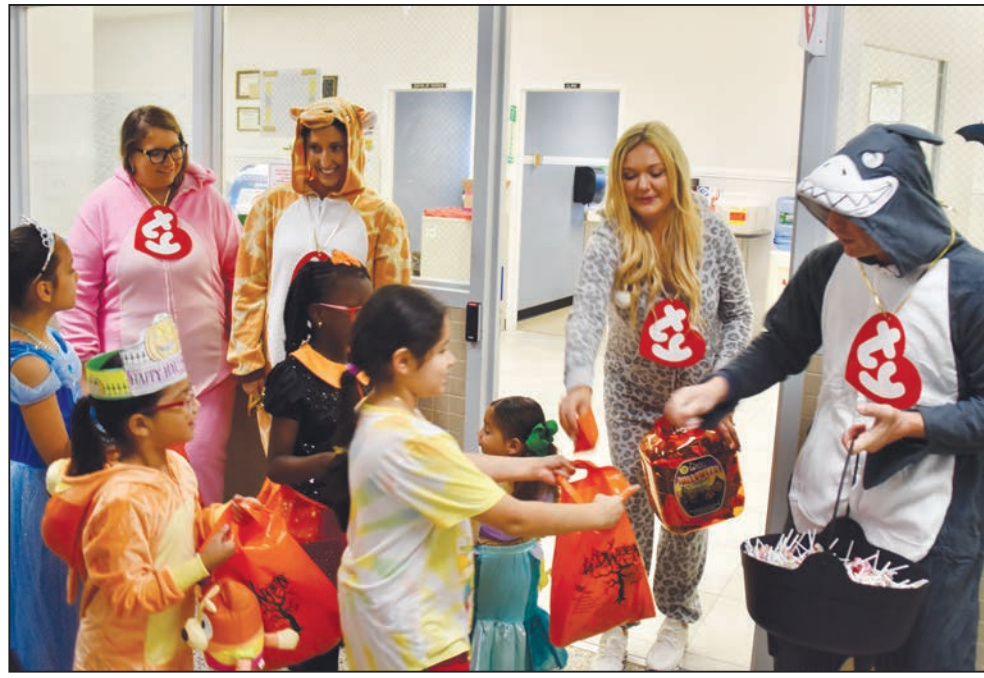
City staff dressed in costumes handed out candy to trick-or-treaters.