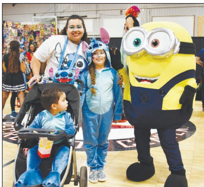
Attendees alongside a minion from Despicable Me.