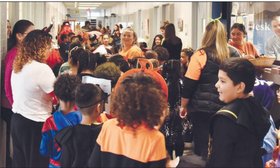
The hallways were filled with trick-or-treaters.