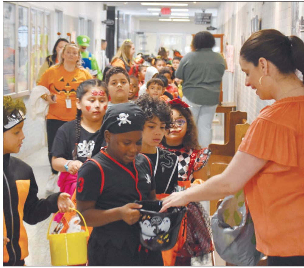
Students stopped by City offices along the way to receive candy and goodies.