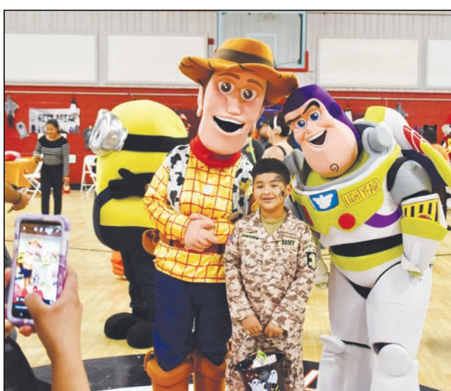
An attendee alongside Woody and Buzz Lightyear from Toy Story.