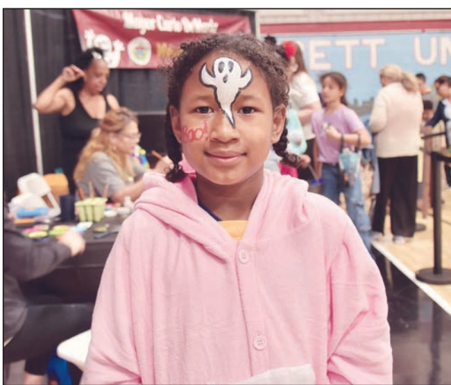
An attendee with one of the designs available at the face painting station.