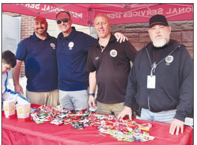
Volunteers from the Inspectional Services Department handed out candy to attendees.