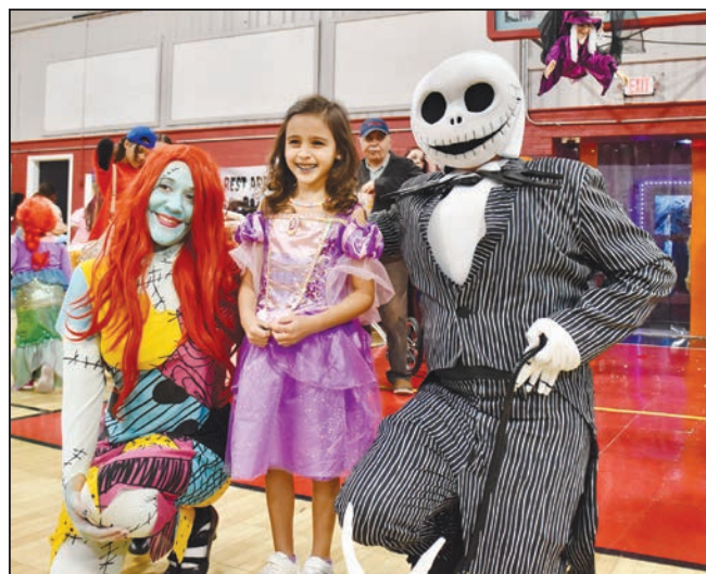
An attendee alongside Sally and Jack Skellington from The Nightmare Before Christmas.