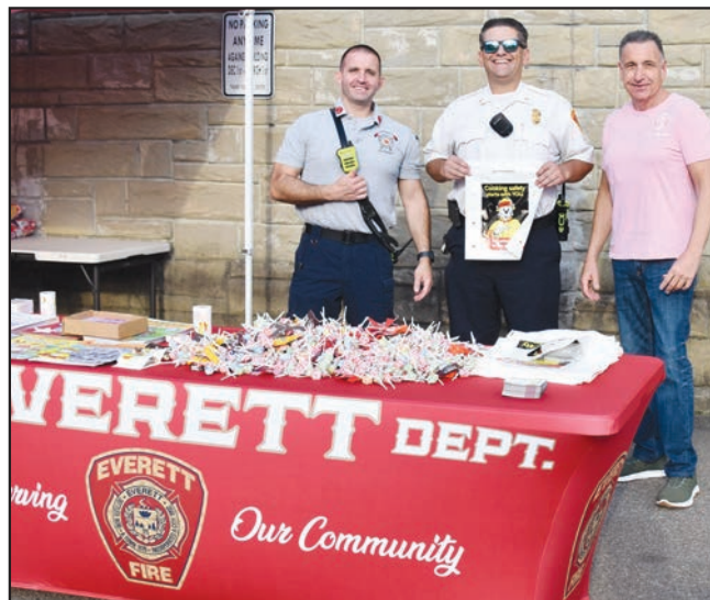
The Everett Fire Department handed out candy to attendees.