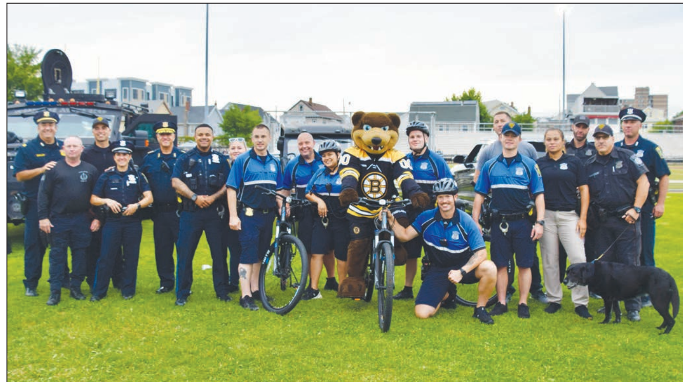
The Everett Police Department alongside Blades.