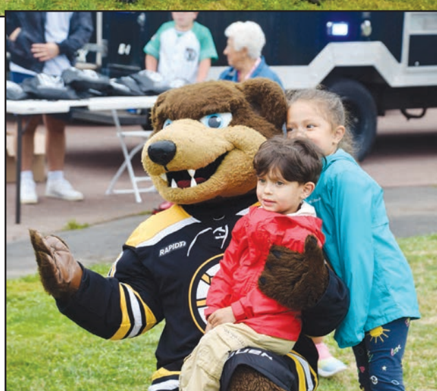
Boston Bruins mascot Blades posing for a photo with some young attendees. See Pages 6-8 for more photos.