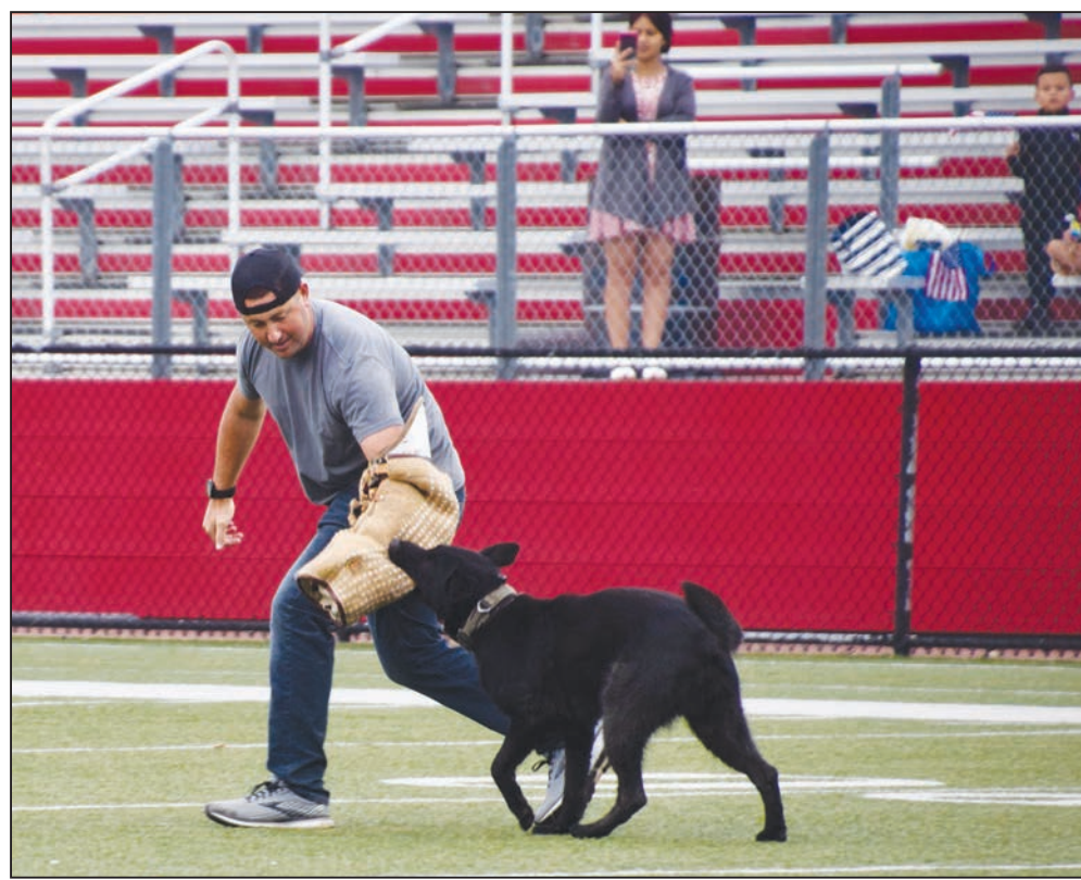
Massachusetts State Police K-9 catching the pretend suspect.