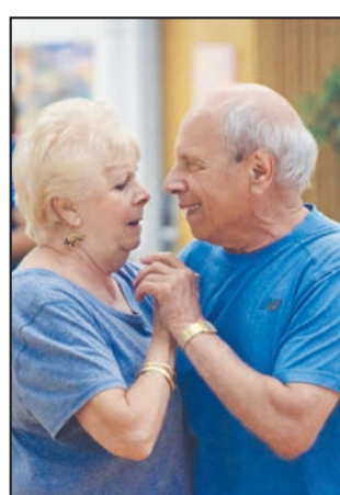
Attendees dancing to the sounds of Seabreeze.