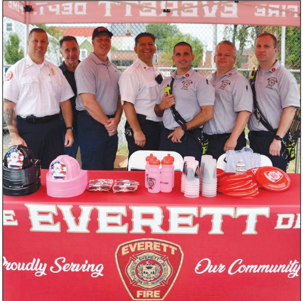
Everett Fire Department.