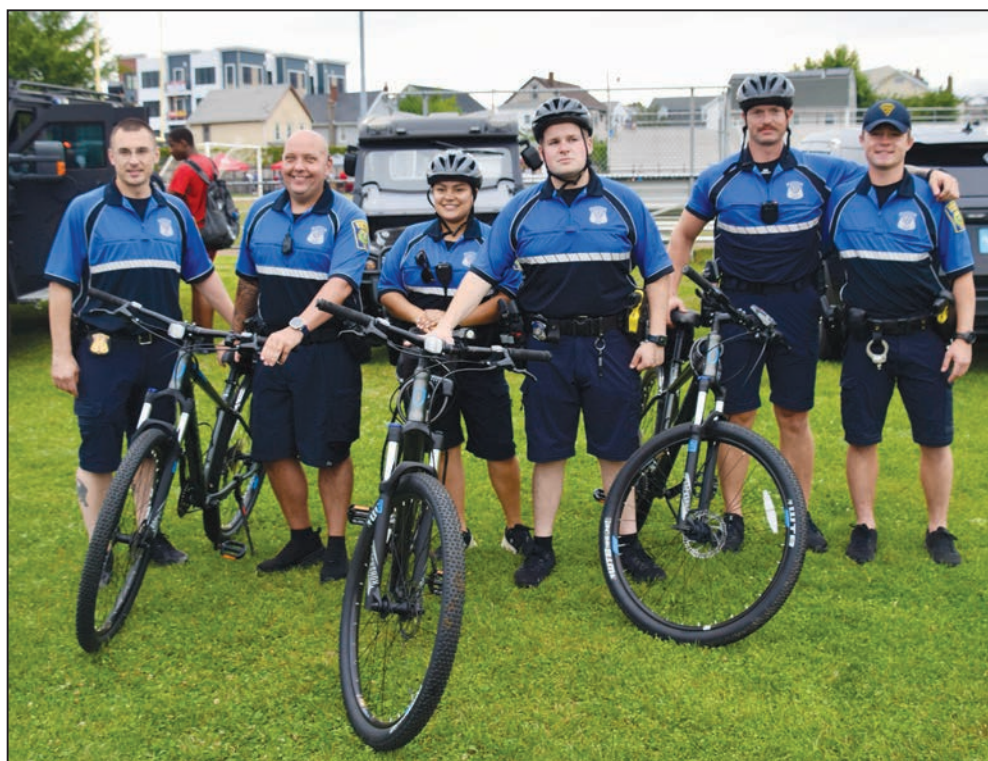
The Everett Police bike unit.