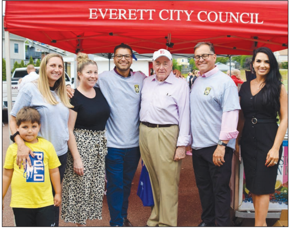
The Everett City Council handed out free slush.