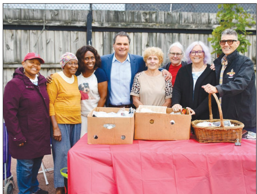
Mayor Carlo DeMaria alongside the City of Everett Council on Aging.