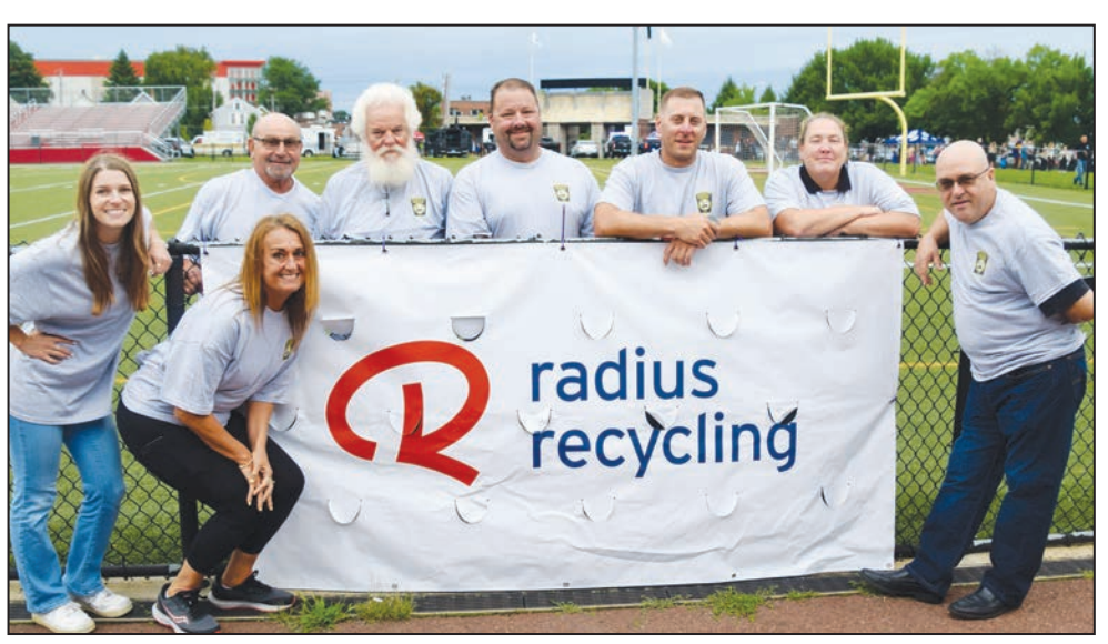
Radius Recycling staff.