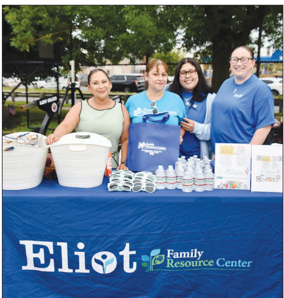
Eliot Family Resource Center.