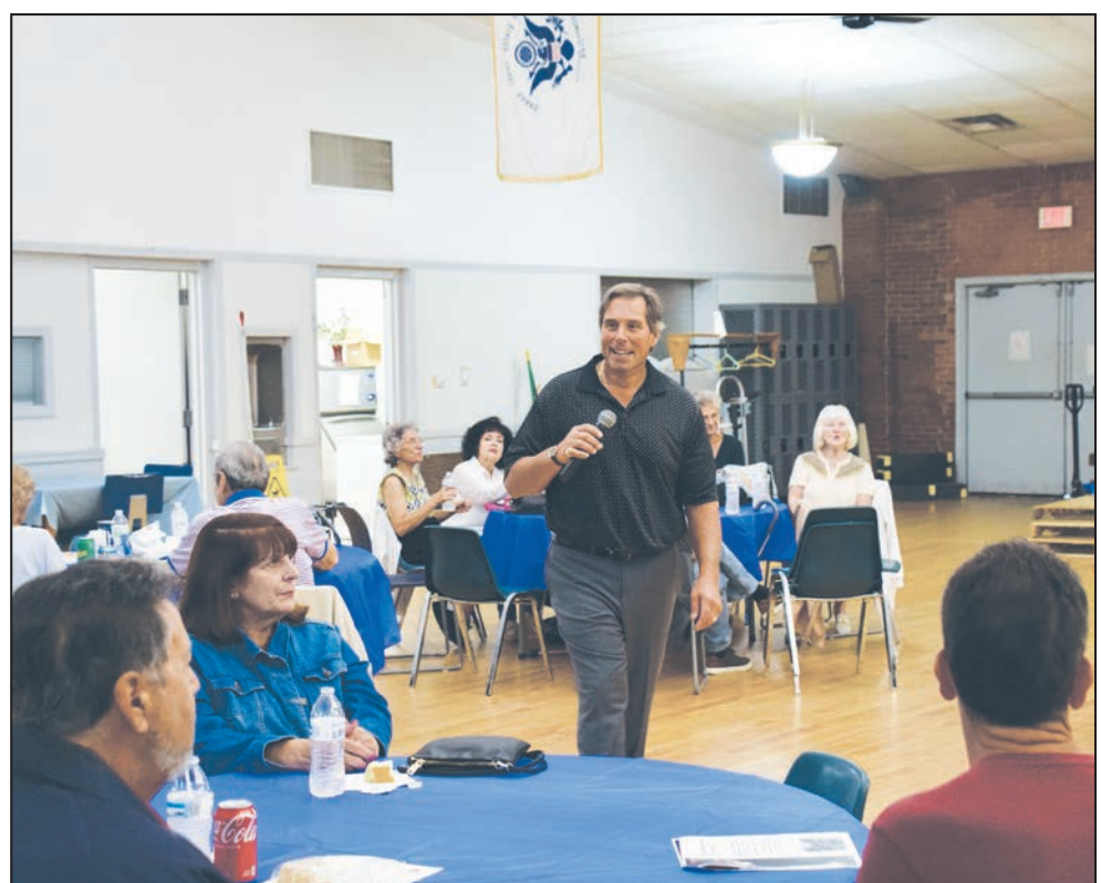
The vocalist got the audience involved throughout the event.