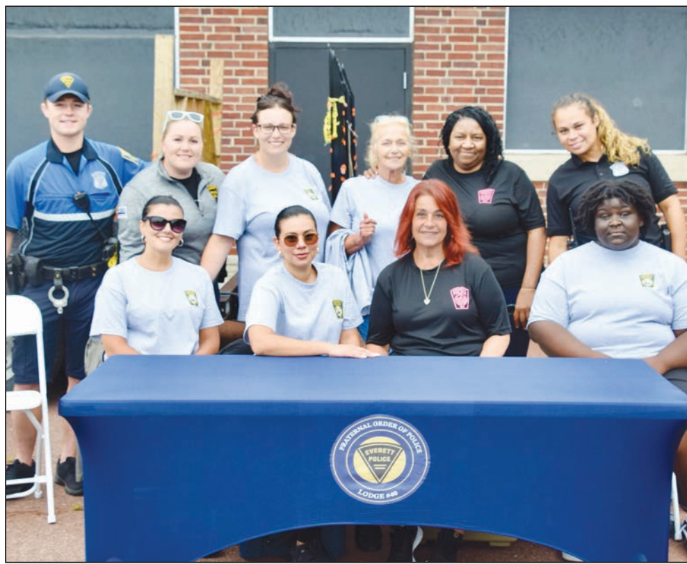
Everett Police Department staff.