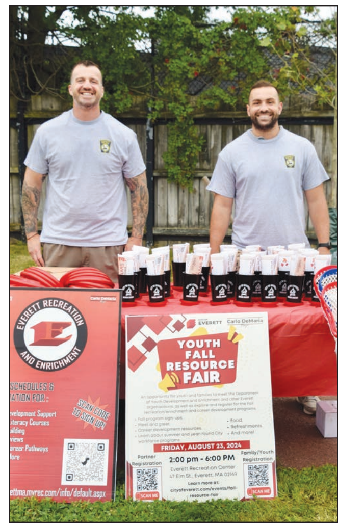
The City of Everett Youth Development and Enrichment Department.