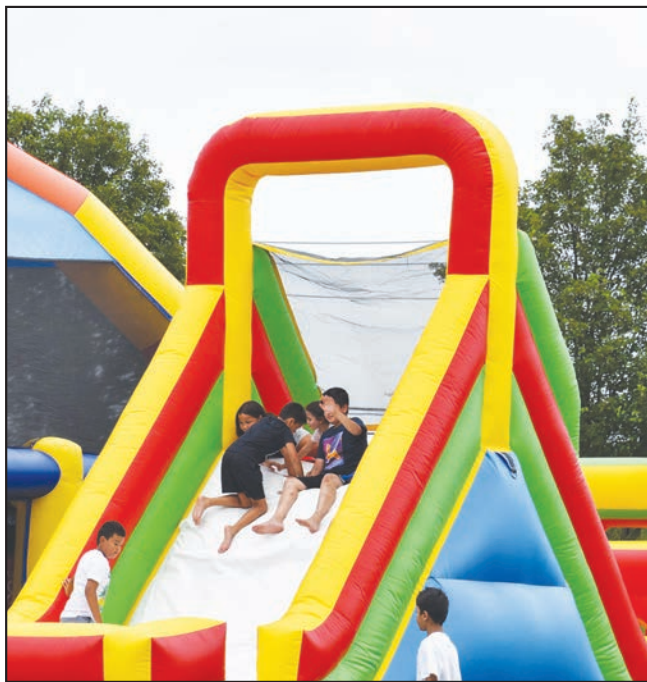
Youth attendees having fun on the inflatable slide.