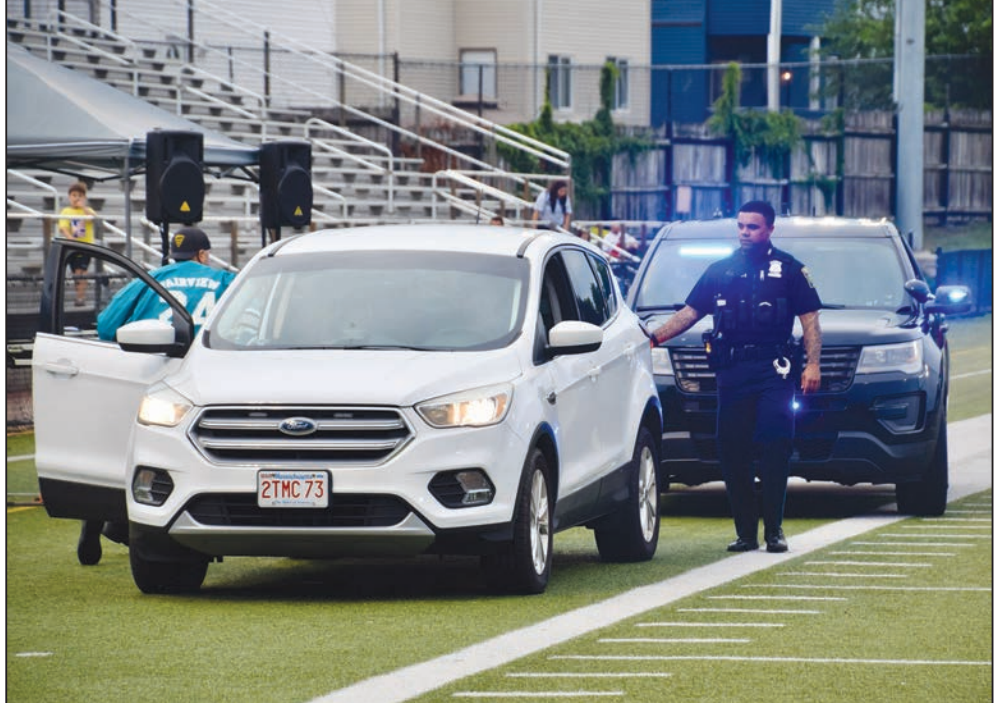
The Everett police and Massachusetts State Police provided a traffic stop and K-9 demon-stration.