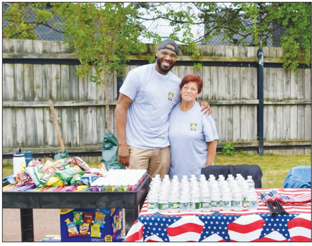
The City of Everett Veterans' Affairs Department.