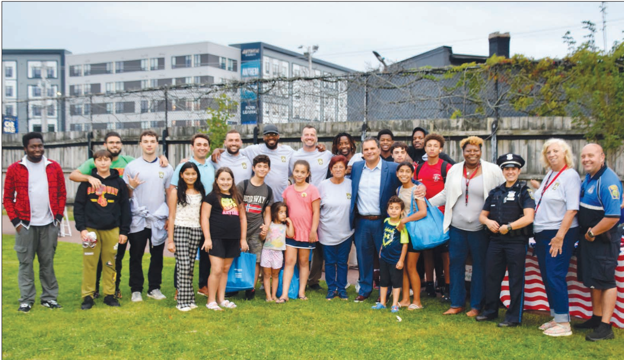
The Everett community joined together for National Night Out.