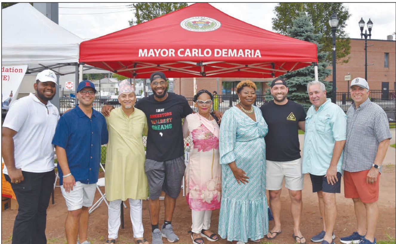
City employees, elected officials and community members joined together to celebrate Nepal Day.