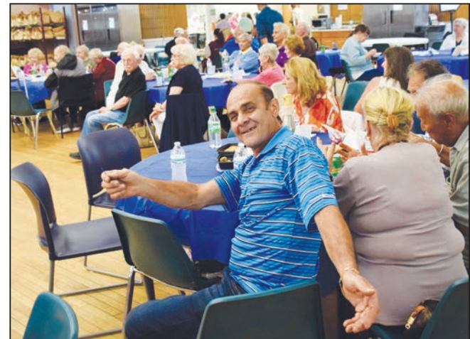
An attendee enjoying the live music and fun at the Connolly Center.