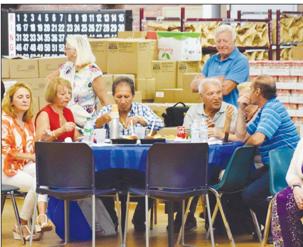
Attendees enjoying the summer concert at the Connolly Center.