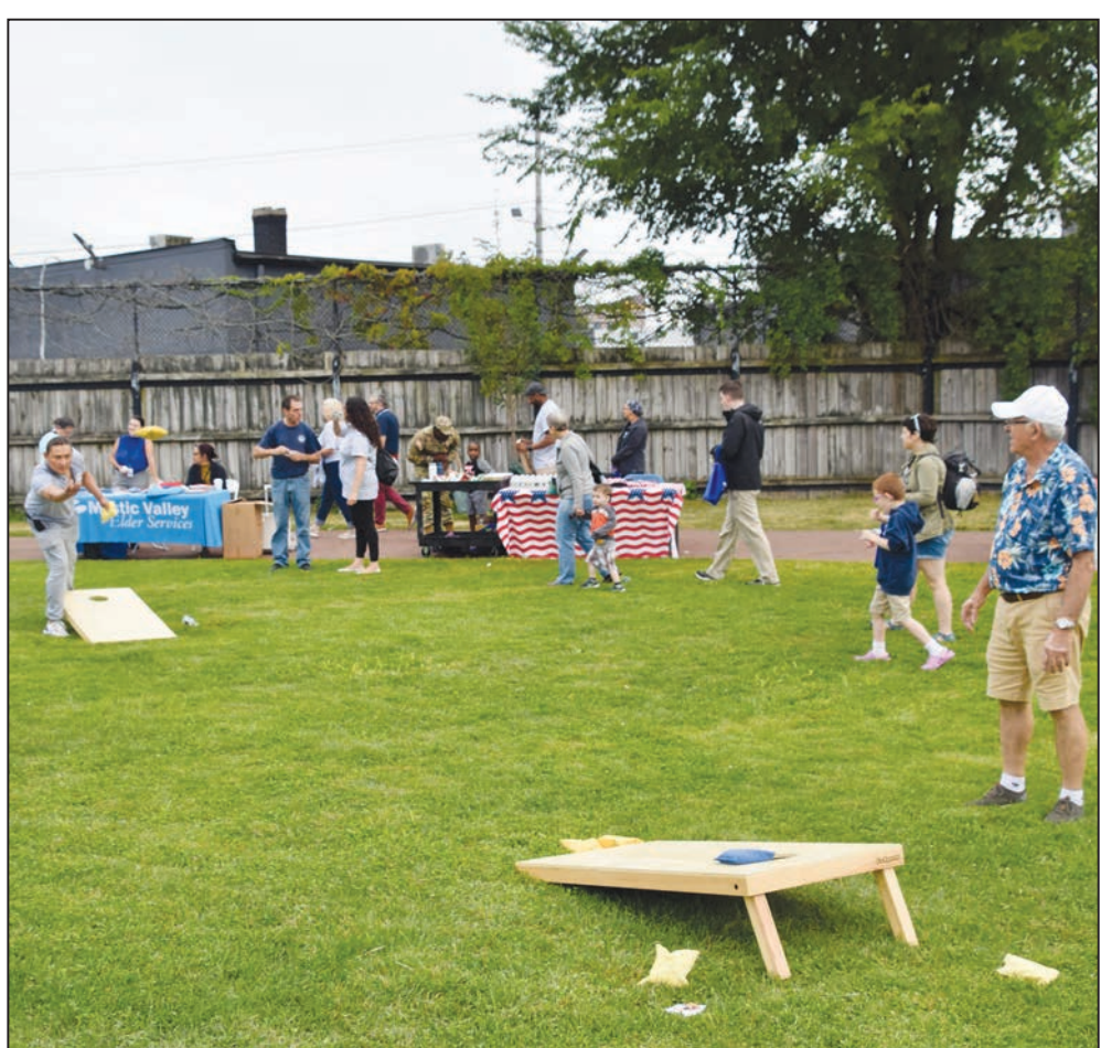
Attendees playing cornhole.