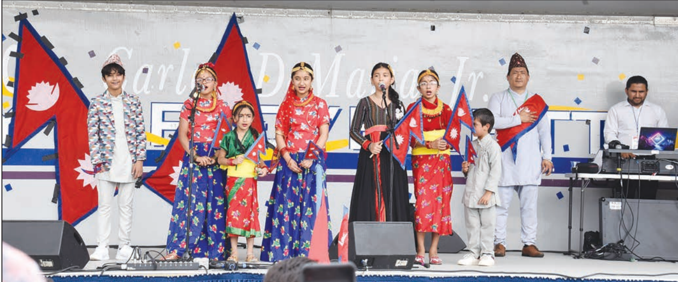
The event featured live performances throughout the day.