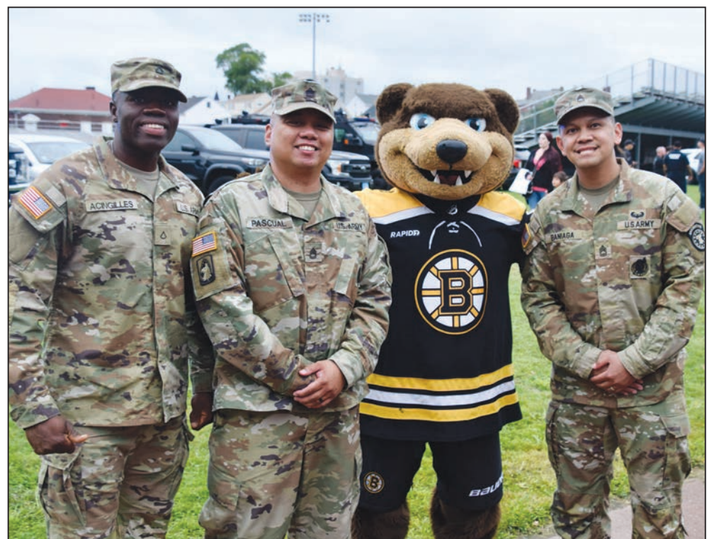
Members of the Malden U.S. Army recruiting office alongside Boston Bruins mascot Blades.