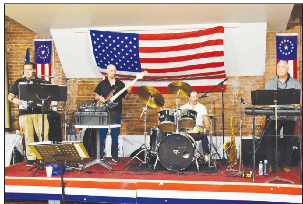
The band performing throughout the evening.