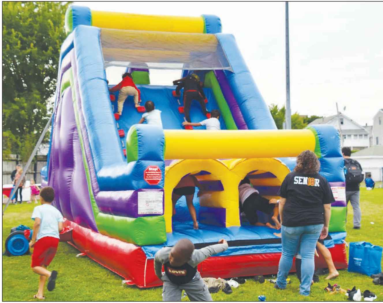
Youth enjoying the inflatable obstacle course.