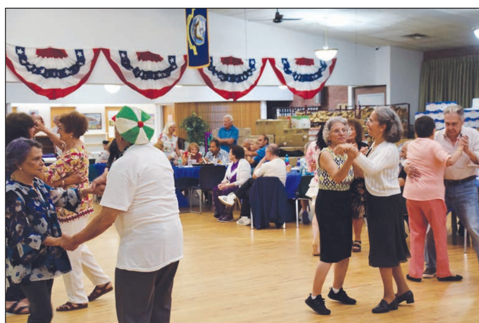
Attendees were moving and grooving to the music.

“I’d like to thank our Council on Aging team