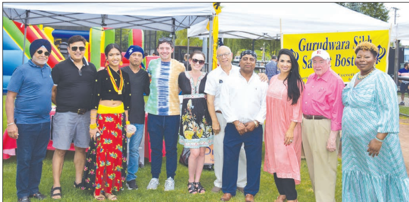
City officials alongside community members at the annual Nepal Day event.