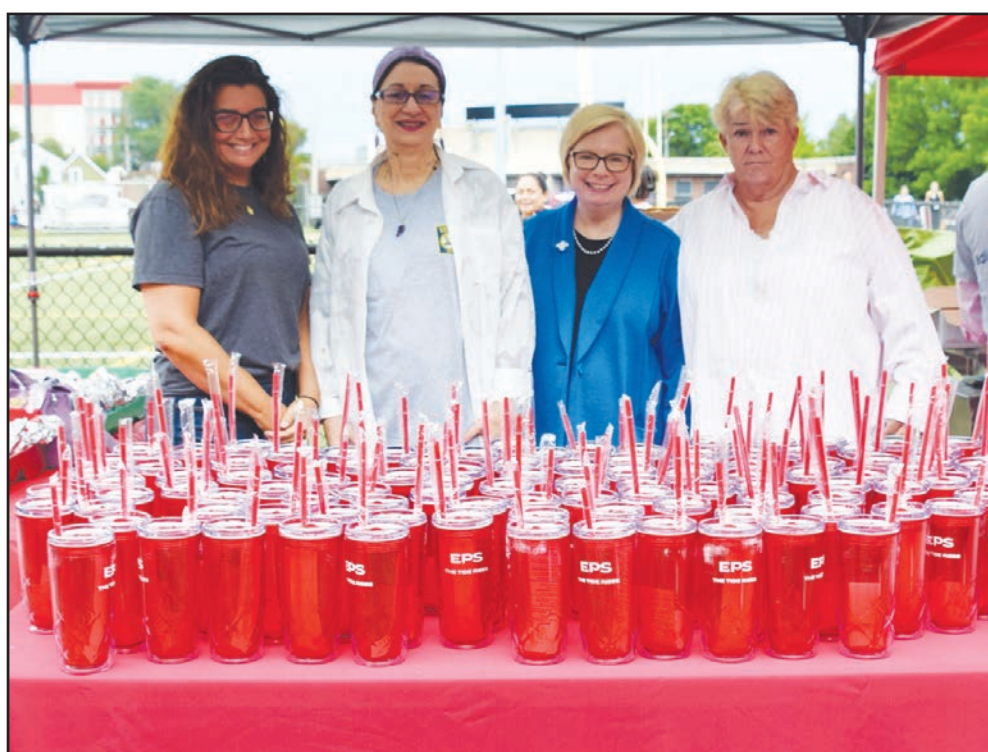
School Committee members and employees handed out free water bottles.