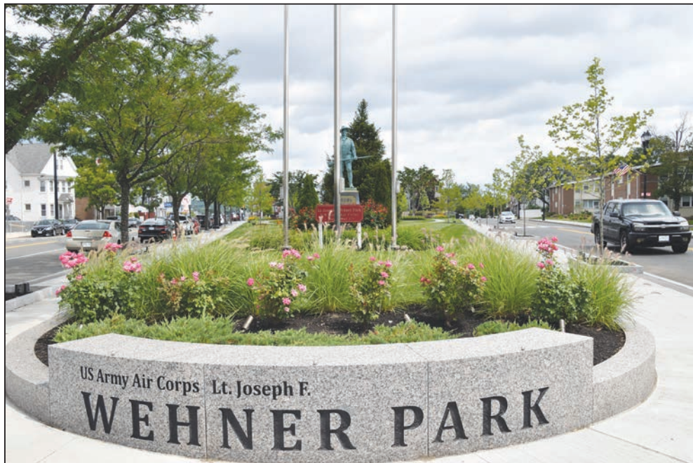
Shown (above and below) are views of what Wehner Park looks like now.