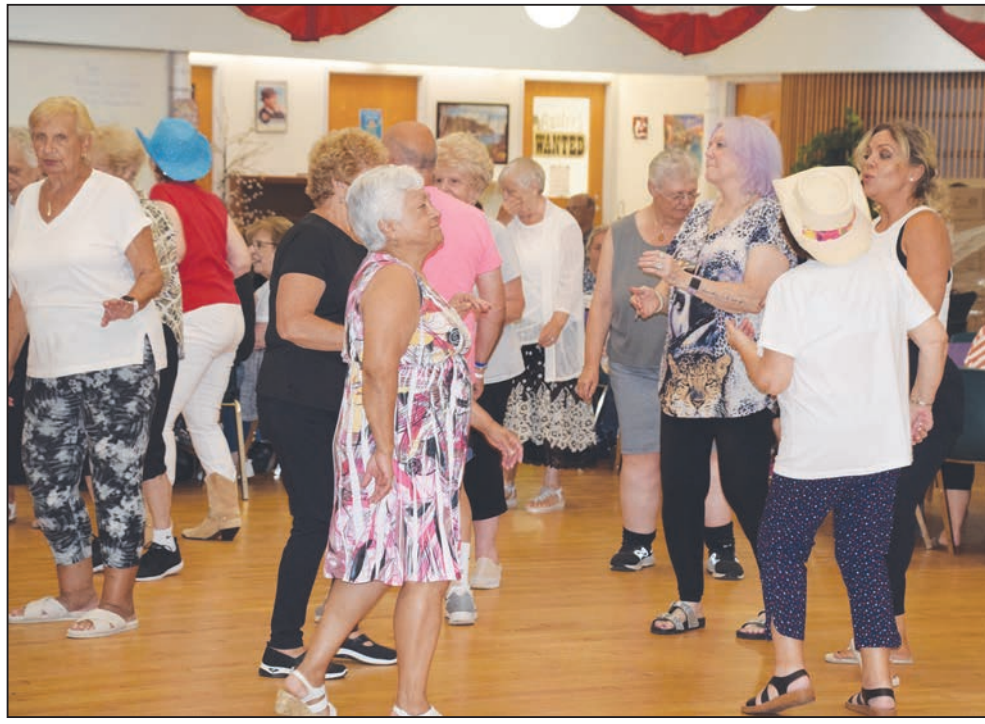
Scenes of members and staff of the Connolly Center enjoying the The City of Everett Summer Concert with the dynamic band "Stomp N' Holler."

The City of Everett Summer Concert series continued on Thursday, July 25, with the dynamic band "Stomp N' Holler