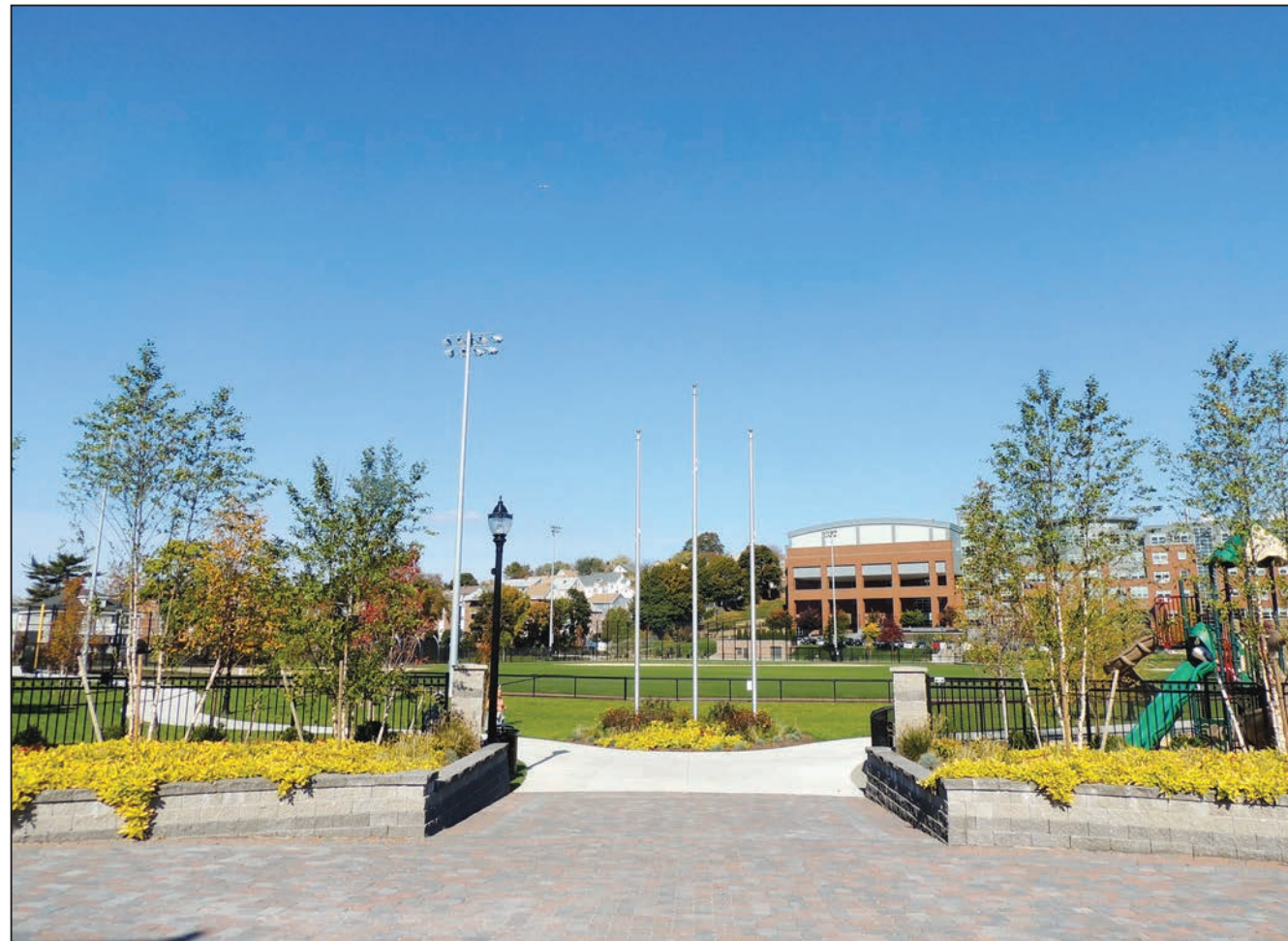
Shown (above and below) are views of what Glendale Park looks like now.