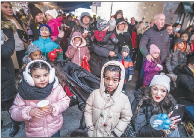
The audience listens as a choir comprised of combined Girl Scout Troops throughout Everett sings various Holiday standards.