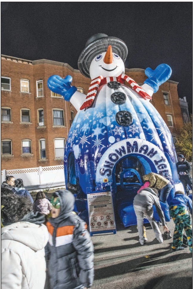
Kids flock to the Snowman Bouncy-House.