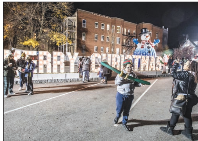
The Parking Lot at School Street Place was equipped with social media backdrops, a Snowman Bouncy-House, and a Holiday Trolley Ride.