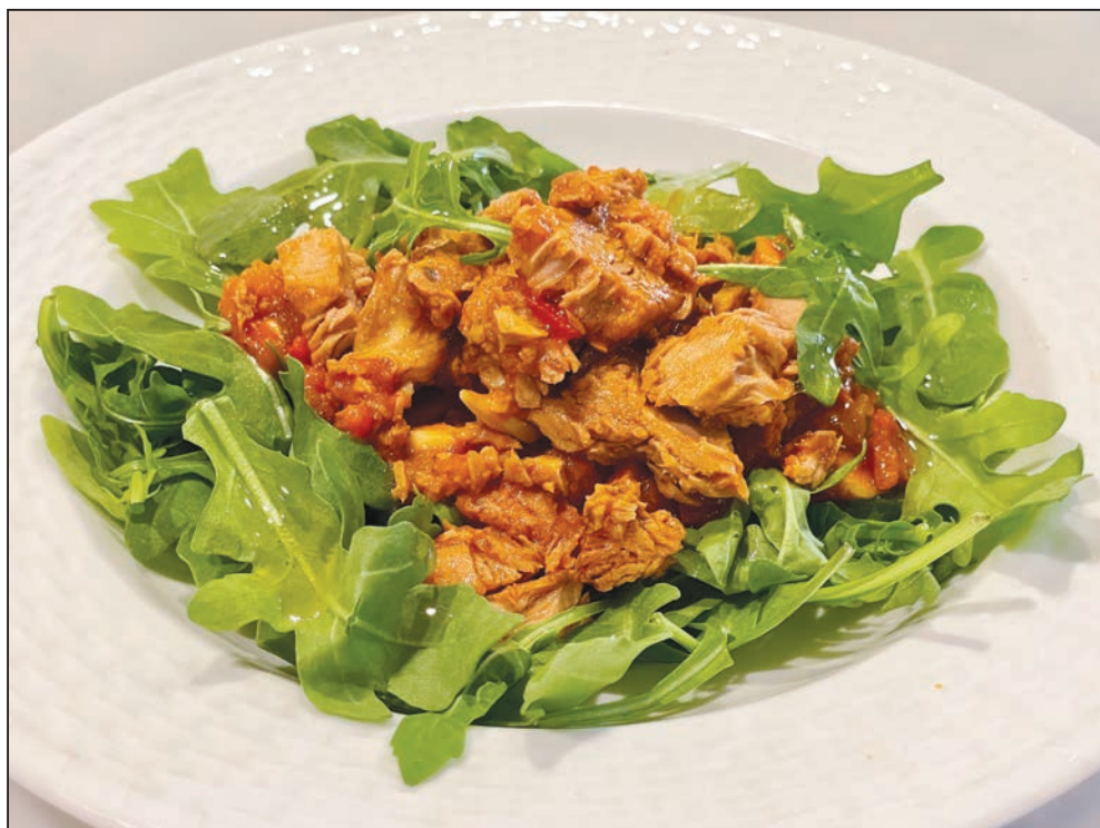
For a quick lunch, it took minutes to pull the tab on a can of Sicilian Caponata with tuna and arrange it on a bowl of arugula.

At the end of a long day, you might reflect on what you ate and decide you didn’t get enough protein. When this happens, we grab a can of Freshé Sicilian Caponata or Provence Niçoise. You can have it with good bread, on top of a salad, or mixed with grains, legumes, or beans. We’ve added a few cans of these products to our emergency meal stash since canned tuna usually has an extended best-by