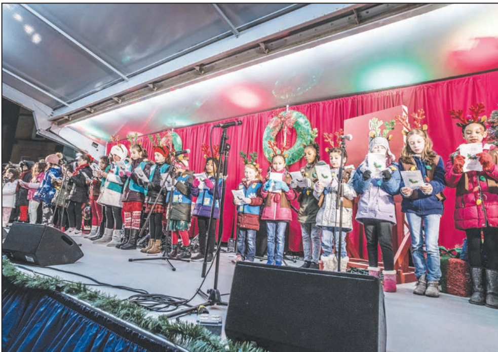
A choir comprised of combined Girl Scout Troops throughout Everett sings various Holiday standards.