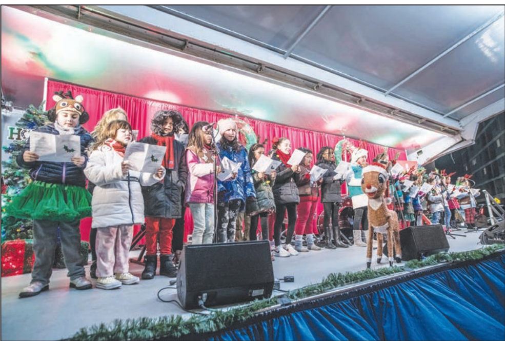
A choir comprised of combined Girl Scout Troops throughout Everett sings various Holiday standards.