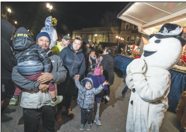
Frosty The Snowman mingles in the crowd and makes some new friends.