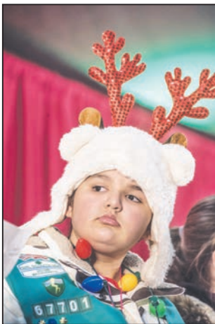
A Girl Scout pauses to contemplate the joy and magic of the Holidays.

The City Of Everett held a celebration in lighting the Christmas Tree at Broadway and School Street. Musical performances, trolley rides, activities, food vendors, and more awaited attendees. Also Santa and Mrs Claus received visitors from the many good children in Everett at the Public Library. There was fun for all.