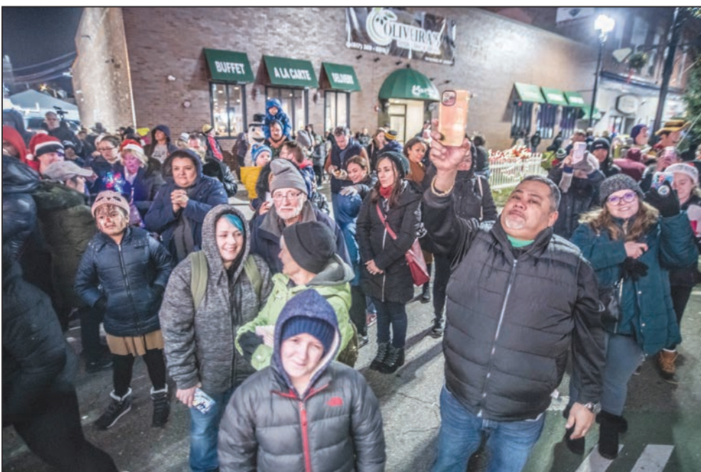
The audience listens as a choir comprised of combined Girl Scout Troops throughout Everett sings various Holiday standards.

B O S T O N ’ S N E I G H B O R H O O D B A N K ™