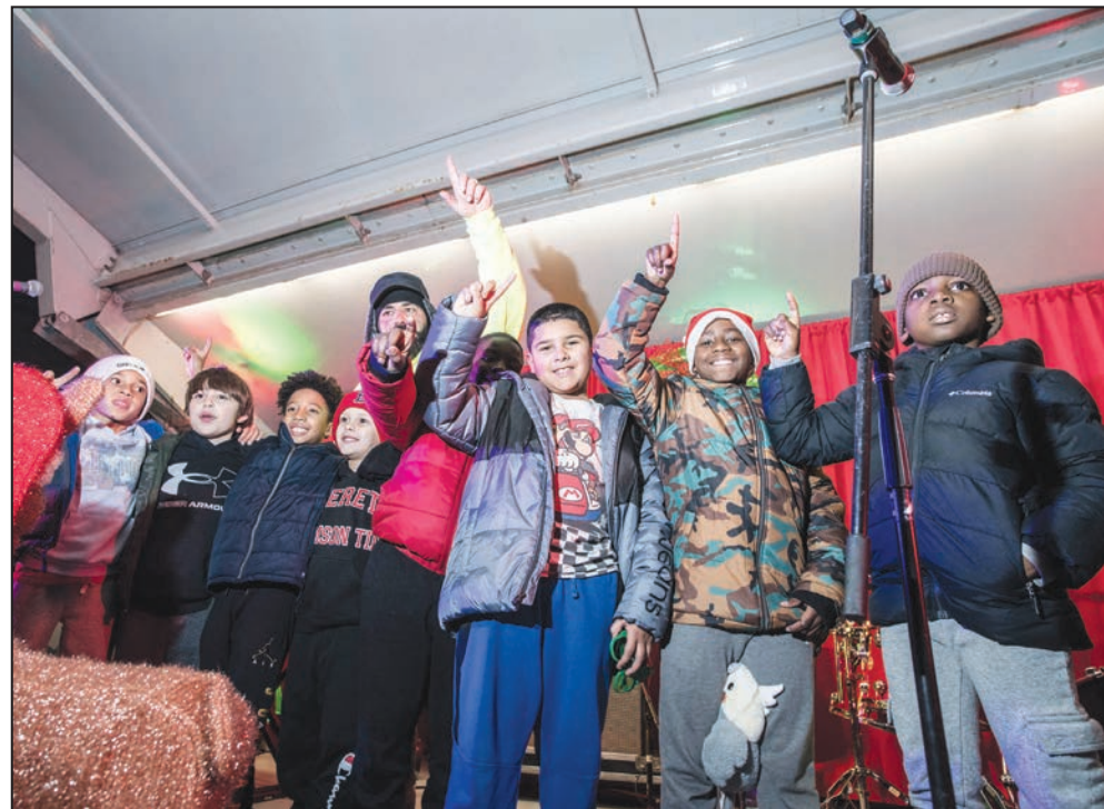
The Everett 8-U Football Team.