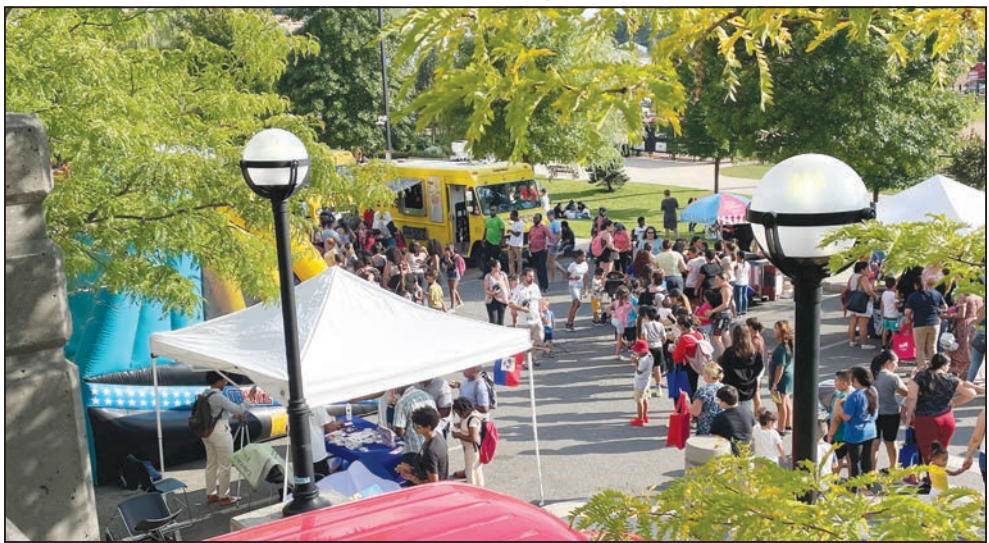
Students and families in the Everett Public School system came out to Everett High School to usher in the school year with the City’s second annual Back to School Bash. See more photyo on Page 8.

Back to School Bash. The district-wide event was held on Monday, August 29th in front of Everett High School. There was food and treats from The Chicken and Rice Guys, the Cookie Monstah, and Richie’s Slush, as well as games and activities, a photo booth, and giveaways. The district’s partners from the Eliot Family Resource Center and the Everett Haitian Community Health Center helped make the festivities a big success with the approximately 1,200 people who attended.