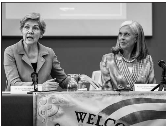
Sen. Elizabeth Warren and Asst. Speaker Catherine Clark shown discussing the benefits for seniors in the Inflation Reduction Act at a roundtable discussion in Waltham last week.

“With the Inflation Reduction Act, seniors won’t have to choose between putting food on the table and paying for lifesaving prescriptions. More families will be able to