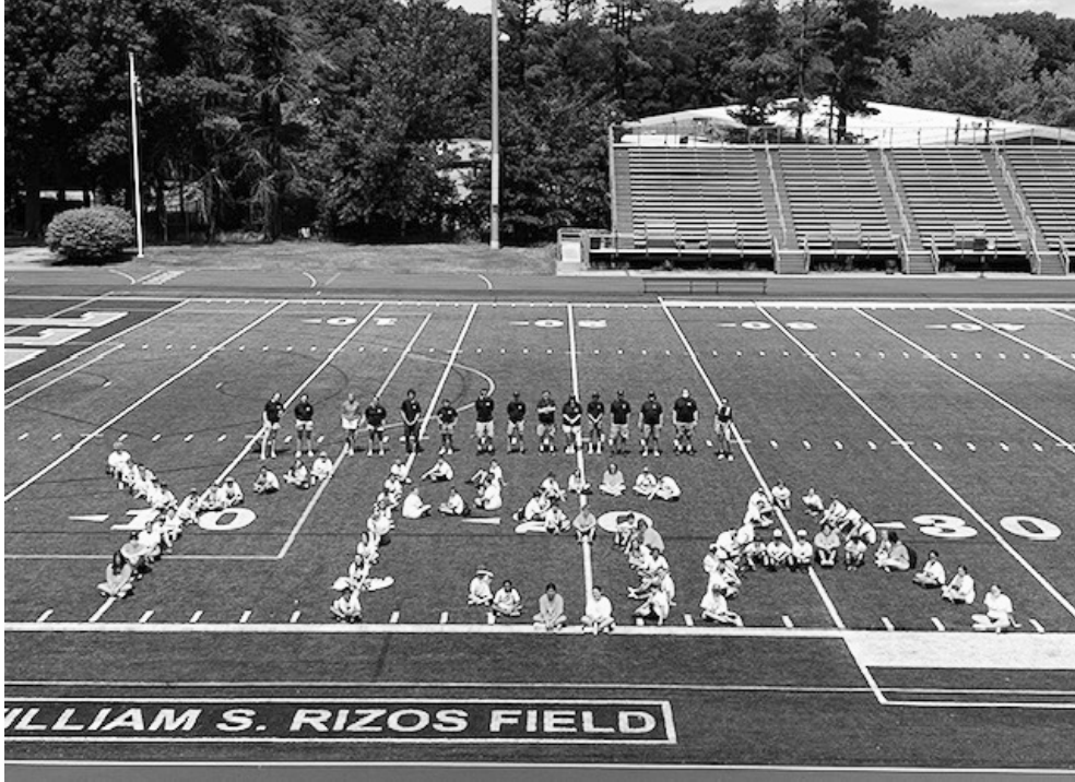
Week 3 participants of the Youth Public Safety Academy spell out YPSA on the field at Lowell's Cawley Stadium at the conclusion of Community Day in late July.