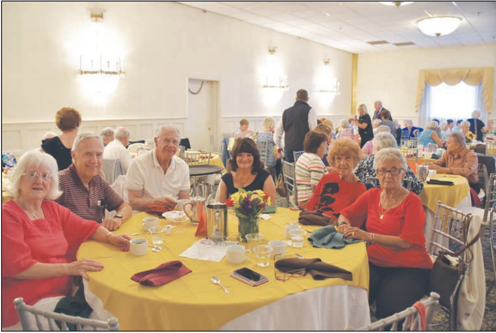
A large number of residents turned out at Anthony’s for the event.