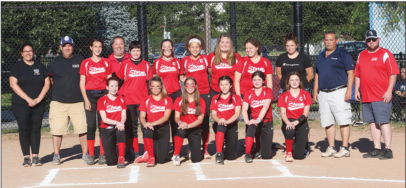
The Everett Storm, sponsored by Stewarts Pub, the 2021 Everett Girls Softball League Champions.