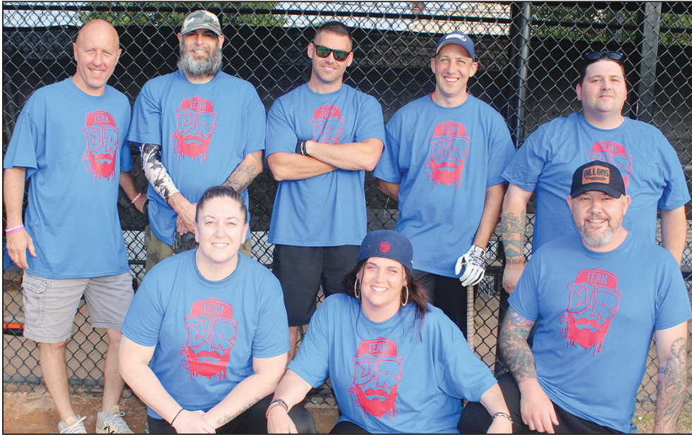
The Team Junior softball players, pictured at the Rob Rocco Memorial Softball Fundraiser at Glendale Park.