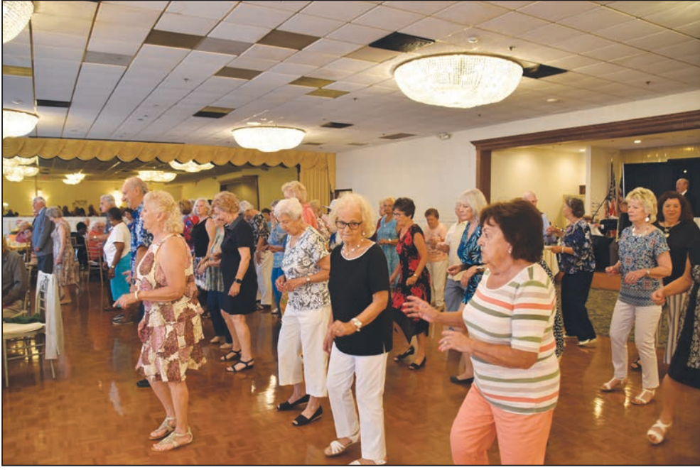
Group dancing always a hit.