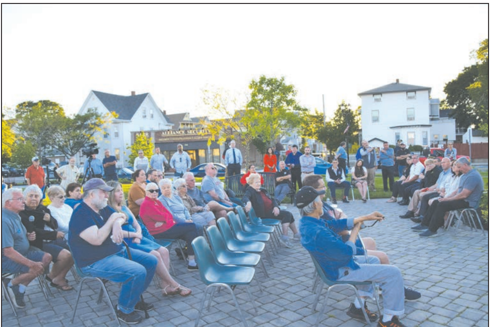
Many Ward 4 residents turned out to talk with Mayor Carlo DeMaria.