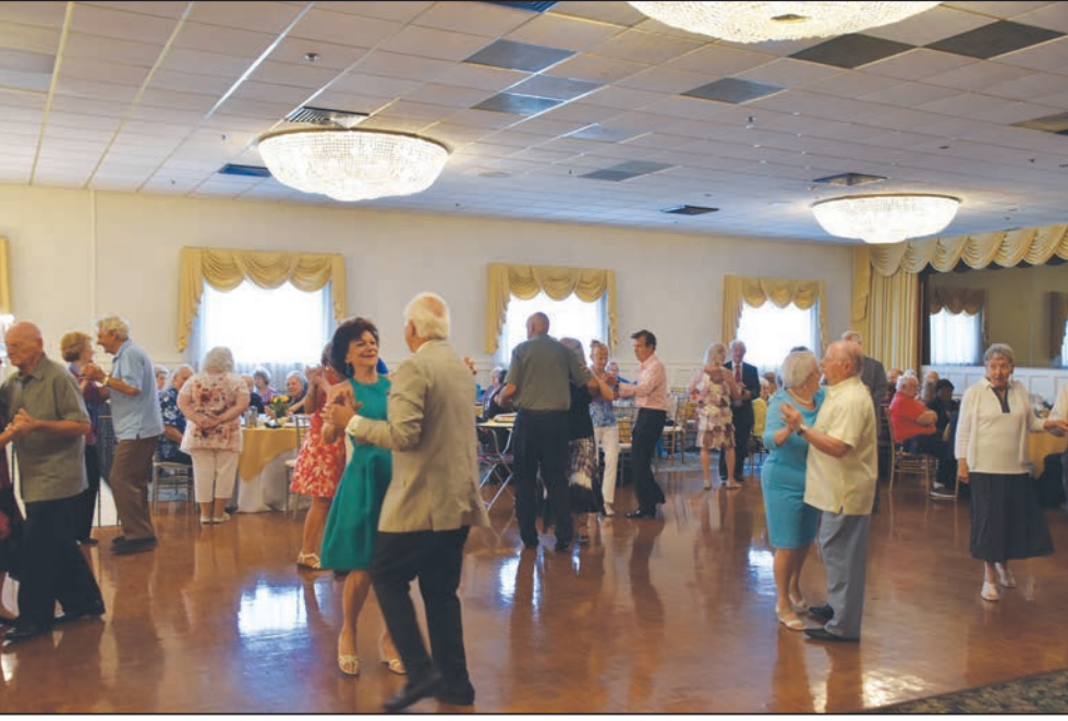
The music got people up and on the dance floor.