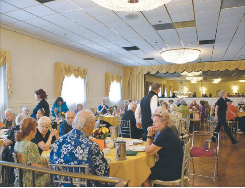
The event was well attended.