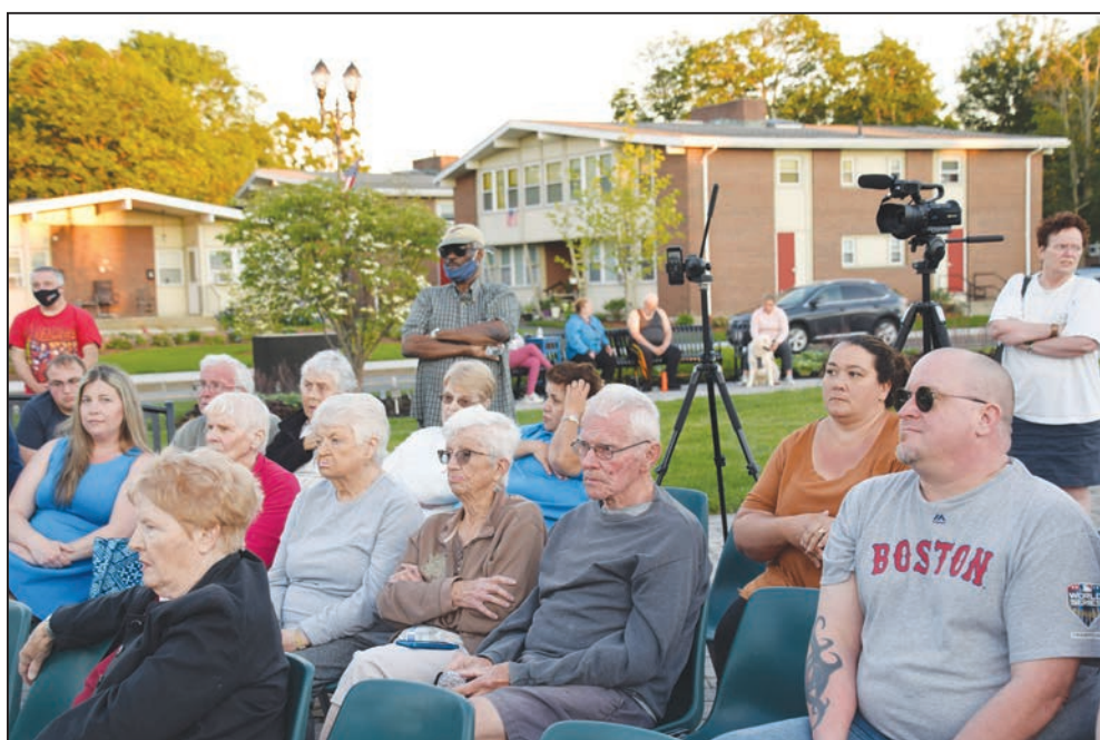
Ward 4 residents listen to how the mayor will resolve their issues.