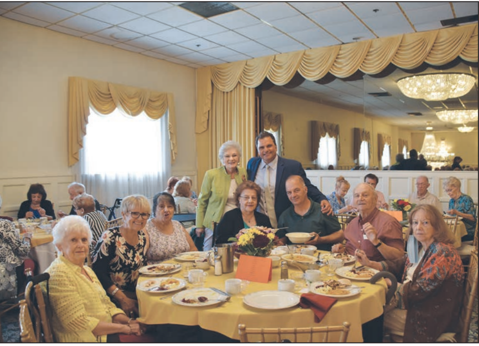
Mayor Carlo DeMaria with event attendees.